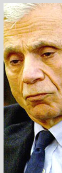
The next high-profile California murder trial is on deck.